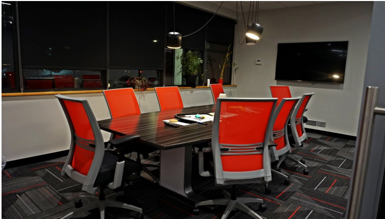
Common Conference in Lobby