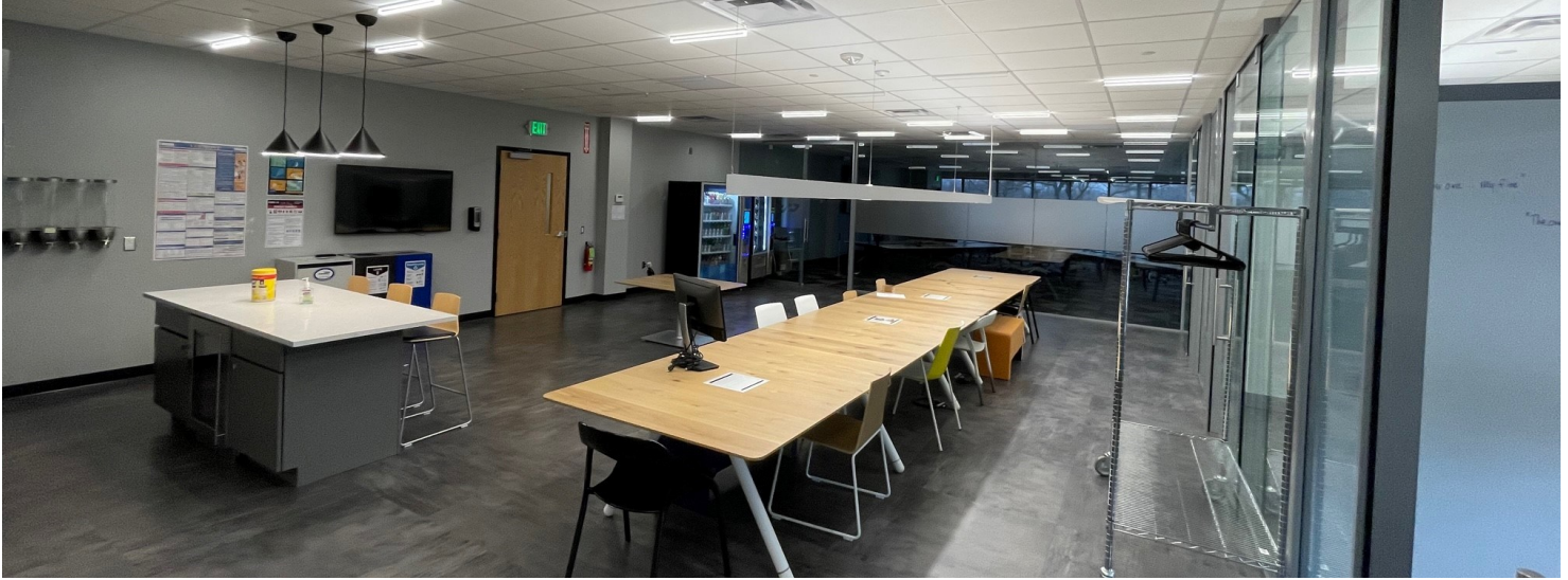
OPEN KITCHEN COLLABORATION AREA