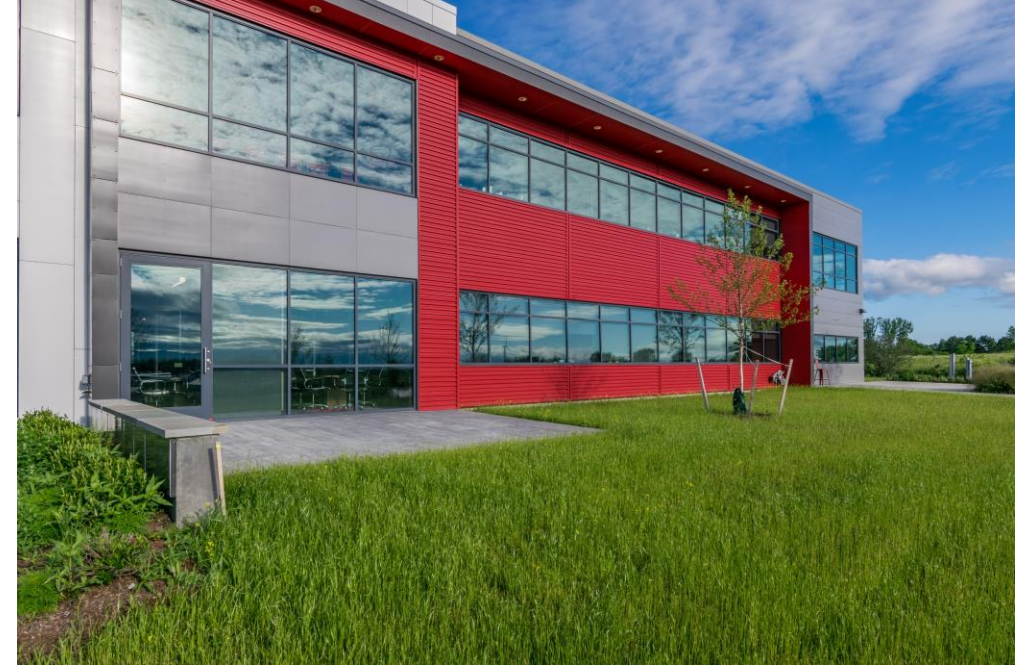
HRG Office Campus – Phase 1 – Completed March 2017

The project is build to suit by BlackRock Construction and can be delivered in 2020.