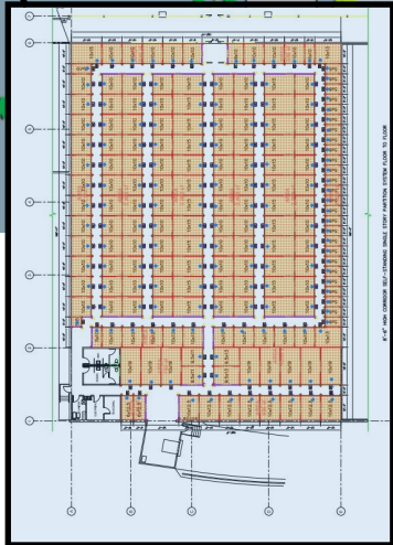
Potential for a 182 unit indoor storage facility.