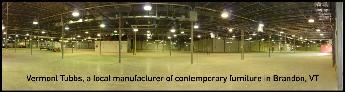
Vermont Tubbs, a local manufacturer of contemporary furniture in Brandon, VT

A state of the art facility located strategically between Montreal, Boston and New York, just north of the town of Brandon, Vermont with all the space, power and amenities to accommodate the most demanding manufacturing operation.